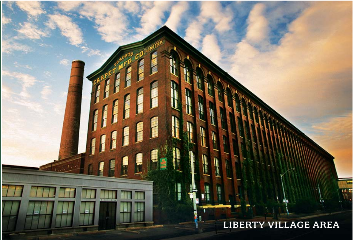
LIBERTY VILLAGE AREA